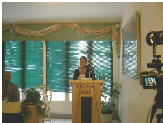
Launch of CANROP

The Bethesda Rural Women Group which was launched in October 2004 became a member of CANROP in July 2005. The launch was attended by the Minister of Agriculture and Minister of State, the ECS Representative, the Director of Gender Affairs, Director of Agriculture, members of CABA and other public and private sector persons. Since the launch, the group has organised for training in dress-making and bread making through their own initiative. The members intend to train unemployed women in their community to develop skills to increase or enhance their income earning capacity in the coming year.