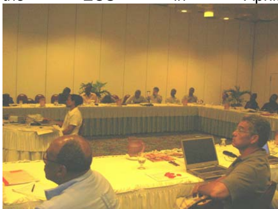
IICA Caribbean Regional Meeting