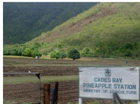
Antigua Black Pineapple to receive IP protection