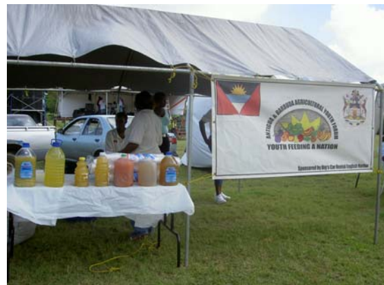
ABAFY booth at Independence Food Fair

in St. Lucia. Participants received training in strategic planning and project development and have improved their capacity and that of their group in these areas. This training was particularly useful for the ABAFY since in the reporting period they were the recipients of the Caribbean Food and Nutrition Institute/Pan American Health Organisation (CFNI/PAHO) Small Grants Program. The funds are for a project to construct a vegetable seedling nursery at the Jennings Secondary School. The construction of this nursery was set back due to unfavourable weather conditions.