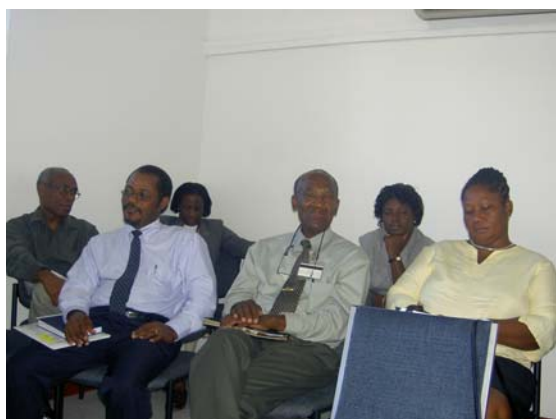
Port health seminar, Permanent Secretary, Ministry of Agriculture second from left

The results of this assessment will be evaluated in 2006.