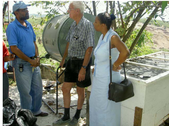
Field visit to Vermicomposting site