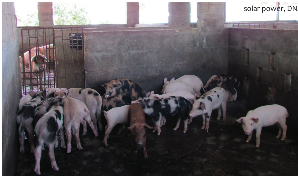
Livestock at Saint Lucia farm.

“Farmers have reduced the acreage of their farms due to this crime”, says Dr. Graham. “Agriculture stakeholders in primary production might not be able to sustain or improve their operations at the current level of risk associated with praedial larceny”. This is where the next domino begins to fall. If farmers even just reduce acreage as a result of this crime, it means they will also decrease their number of employees. According to statista.com , in 2011 approximately 16% percent of employees in the Caribbean were working in the agricultural sector. The situation seems to have gotten much worse in 2016! Already, due to a variety of factors, agricultural employment in the Caribbean has fallen more than 10% in the last decade. This has impacted incomes and living standards, especially in rural areas. Consequently, it has led to an increase in rural poverty and the migration to urban locations in many places across the Caribbean.