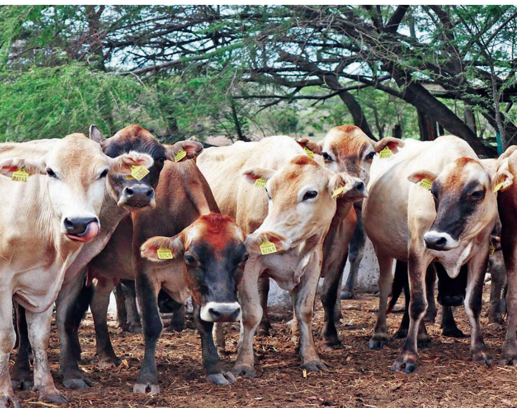
Cattle tagged for tracking to prevent praedial larceny

It is not uncommon for a complete truckload of goats or an entire field of pineapples to be stolen, or a pot of fish at sea to be harvested by praedial larcenists. Available statistics show that commercial crop farmers frequently lose more than 35% of their harvest and from time to time the entire harvest.