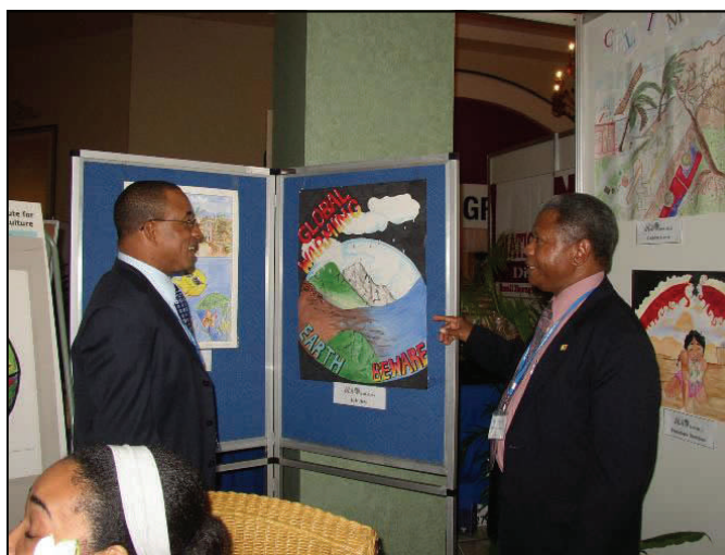
Fig. 9: CWA's Poster Competition. This poster placed 7 th overall at CWA and 2 nd in our local competition.