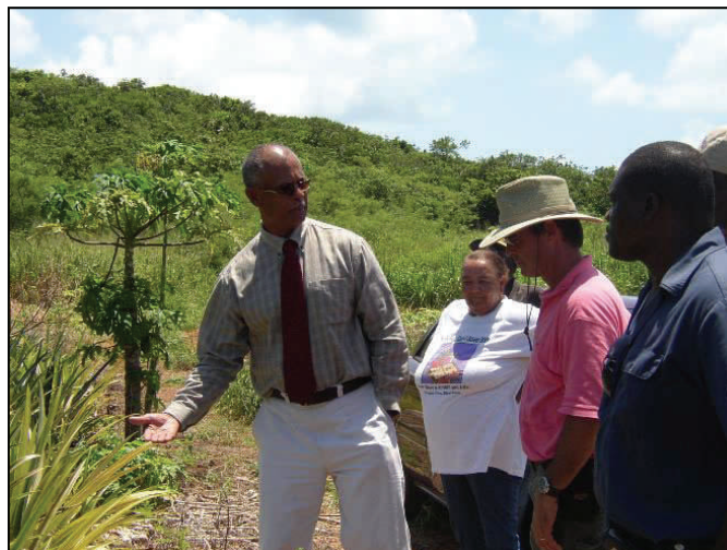
Fig. 10: Regional Specialist and the national committee visit pineapple farm in Eleuthera, Bahamas.

This joint mission was applauded by the partners and other participants as successful due to: