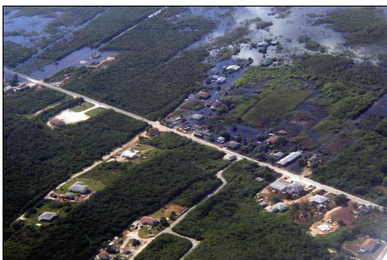
Fig. 2: Aerial view of a flooded area in Long Island after Tropical Storm Noel

There was no doubt that the storm had a negative impact on the island. The cost of repairs and replacement/replanting will be considerable. The appropriate Ministry will provide the estimated damages. The tropical storm, while damaging, has provided an opportunity for lessons on mitigation strategies.