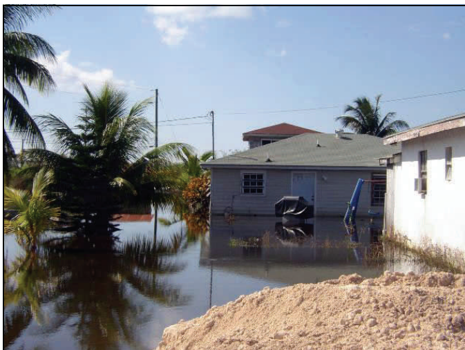
Fig. 3: Flooded house after Tropical Storm Noel.