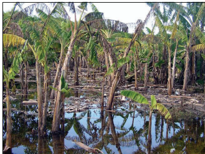
Fig. 4: Flooded farmer's banana/plantain field after Tropical Storm Noel.