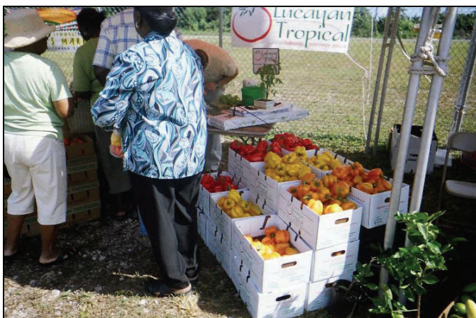
Fig. 5: Customers purchasing at the Lucayan Tropical Booth

The Agricultural Expo was a great comeback event after many years of not having a promotional event to showcase agriculture in the country. IICA's participation as member of the sub-committee was high (there were only three last minute cancellations from Eleuthera, Abaco and Long Island, mostly because of Tropical Storm Noel). However, the Abaco group did send their products for exhibition with the Extension Officer. The enthusiasm of the participants was also high, as they provided an orientation to the state of agriculture in the country. Despite the Tropical Storm Noel, some Long Island farmers did manage to come and participate in the event. The sales were very good and the majority of the Family Island participants were sold out by Sunday. The rapid movement of products is a good indicator that the public is hungry for our homegrown products.