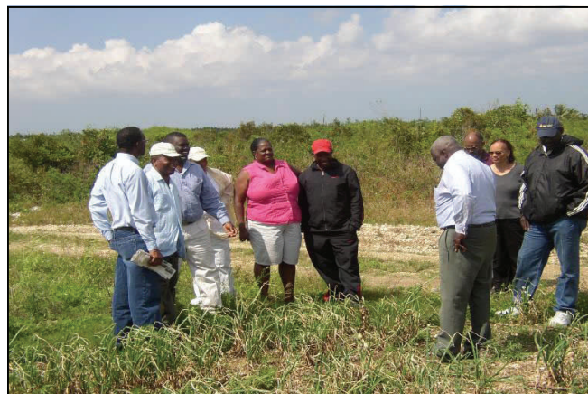
Fig. 13: Council members view onion field soon to harvest