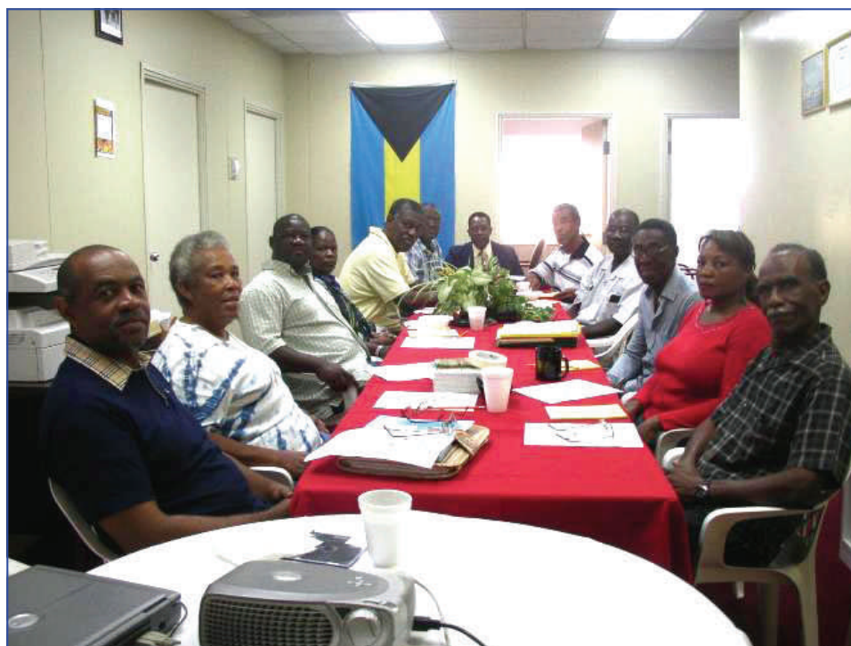
Fig.1: Meeting with the Grand Bahama Co-op on Strategic Planning.

This initial stage of the process was consultative, diagnostic and participatory. The process involved an initial visit to farms of some of the members in Grand Bahama and discussion with the Society members. The visit was to get a first hand view of the challenges and strength of the producing area. Twelve members of the society, representing a cross section of the various kinds of activities, participated in the exercise. There are presently more than 15 members of the society. The strategic planning exercise identified the following major priorities: -Development of business plans, -Technical training and assistance, - Organizational strengthening, Acquisition of equipment and labor.