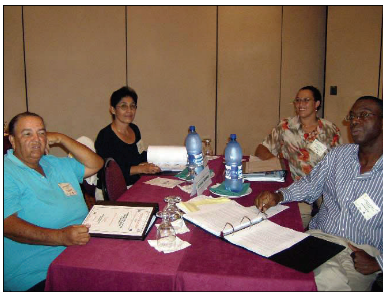
Fig. 7: Agriculture and tourism participants in the Cluster development workshop in October.