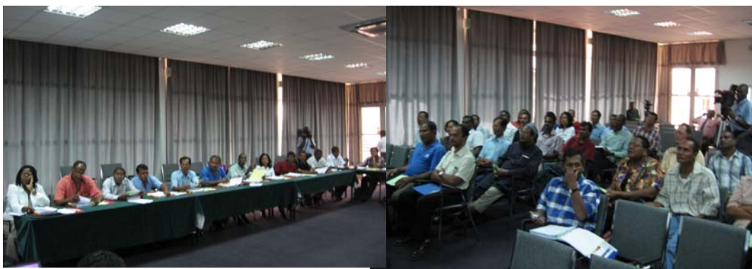
Participants at the Avian Influenza Workshop held by the Ministry of Agriculture (LVV)

The Office continued to support the development of systems and protocols to facilitate continued development of agriculture in the country.