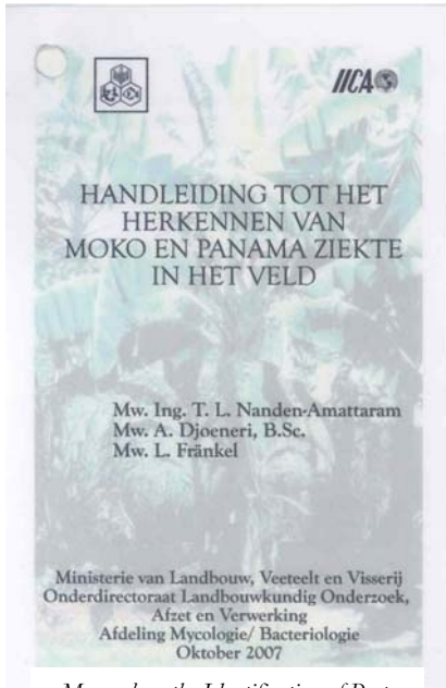
Manual on the Identification of Pests and Disease

The office supported the lamination of posters for the Ministry's pesticide public awareness campaign. One thousand (1000) posters were prepared, laminated and distributed.