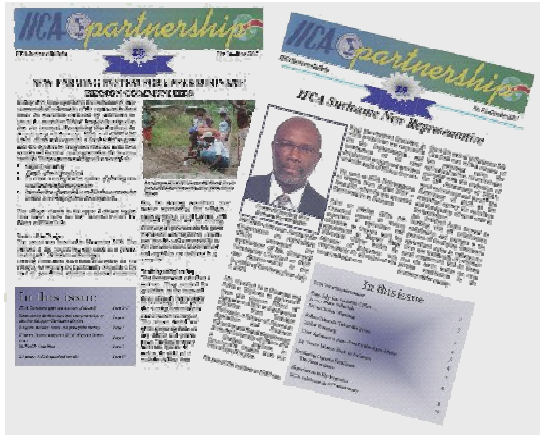
“Partnership” Issue 14 & 15

In order to provide information on Agriculture and Rural Development the Office continued the production and distribution of its newsletter “PARTNERSHIP”.