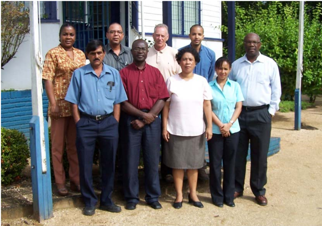
Staff members of the IICA Office in Suriname