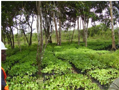
Jatropha nursery at Guyaba

At the Institutional level activities under this thematic area are meant and designed to assist member countries in their efforts to modernize and re-structure their agricultural sectors. By making agriculture more science based and technology driven, it is believed to become more attractive to youngsters and capable of reaching high levels of economic viability.