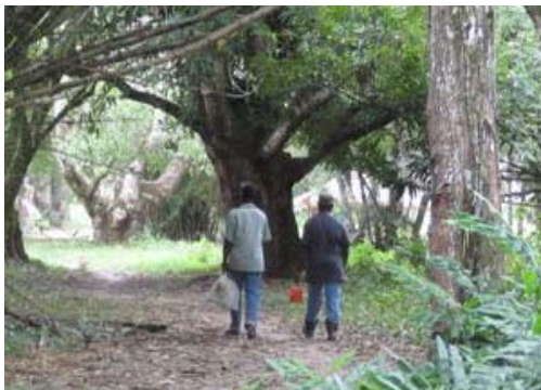
Surveillance activity at the Corantijn River

The Office facilitated the participation of representatives from the Ministry of Agriculture (LVV) in regional fora to discuss the disease and participated in a two-day workshop held for the staff of the Veterinary and Animal Production Services of LVV and the laboratory staff of CELOS.