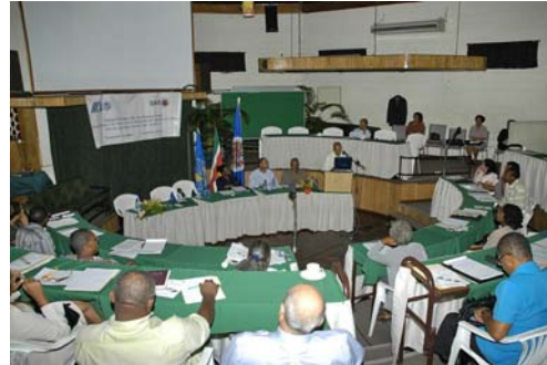
H.E. Richel Apinsa (r), Minister of Transport, Communication and Tourism addressed the participants at the Agro Tourism Workshop

During 2007, IICA continued to implement activities under the OAS funded Regional Agro Tourism linkages project. This project aimed at strengthening the agricultural sector through linkages with the tourism sector. It is spearheaded by the Agro Tourism linkages centre in Barbados and implemented in seven countries in the region including Suriname.