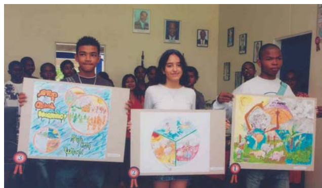
Winners of the Painting Contest

The Office organized an art contest for High school students, entitled: The Effect of Global Warming on Agriculture ". Sixty two (62) students from schools throughout the city participated in the contest.