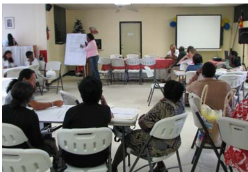
Suriname Network of Rural Women Producers (SUNROP) Revitalizing Workshop

The Office continued its support to Suriname Network of Rural Women Producers (SUNROP) through assistance in revitalizing and restructuring of the organization. A workshop was held in which participants needed to put renewed efforts in revitalizing the Network.