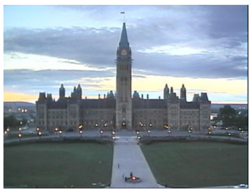
Ottawa, Ontario the Nation's Capital