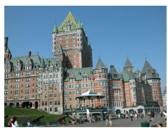
Parliament, Quebec City, Quebec