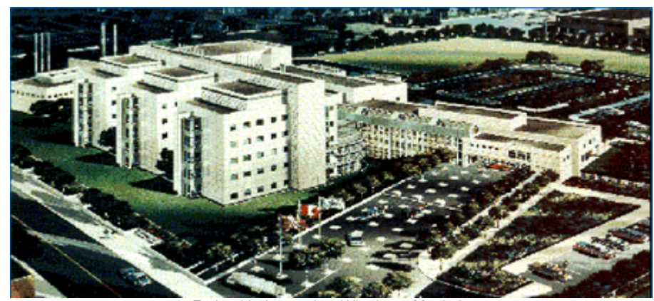
Federal Laboratories, Winnipeg, Manitoba