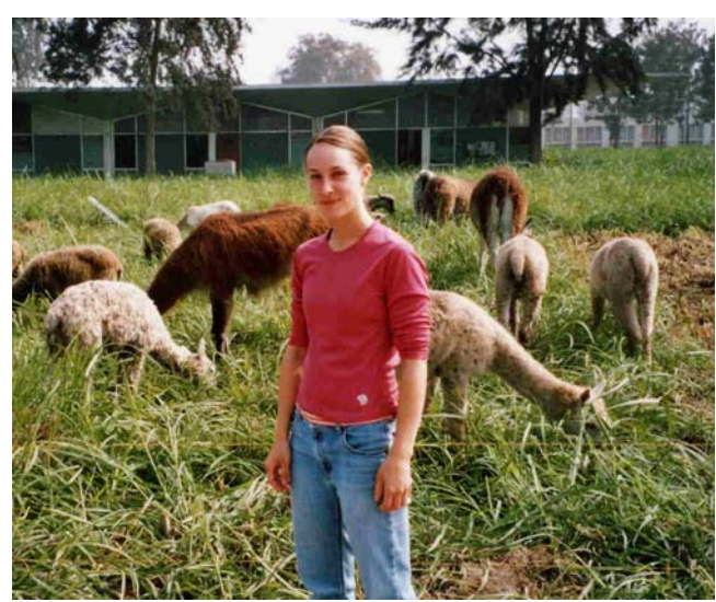
Internship program recipient in Lima, Peru