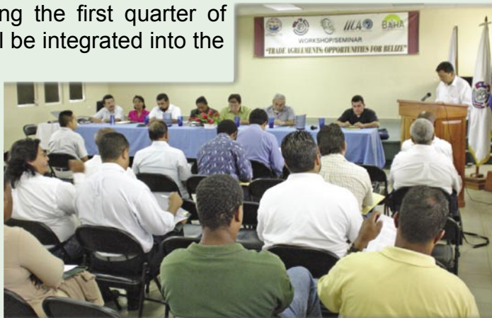
Stakeholders participating in the first workshop/seminar on Trade Agreements-Opportunities for Belize.

costs, harvesting and transportation systems (field to factory), processing and fobbing (transportation from the factory to the ship). This is an ongoing comprehensive analysis with projection for completion during the first quarter of 2006. Outputs from this analysis will be integrated into the preparation of a national adaptation strategy for improving the overall competitiveness of the sugar industry as it adjusts to reforms being implemented in the EU-ACP sugar protocol. Contributions were also made for assessment of the need for establishment of a national export promotion center. The main recommendation from the assessment is for the institutional strengthening of BELTRAIDE with the addition of an export promotion unit along with capacity building for its staff to manage this unit. This activity will continue in 2006 with the application of the recommendations.