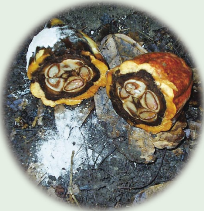
Monilia (frosty pod) infected pod showing seed damage and very high spore population.

Financial and technical support for participation of a BAHA technician, at the WTO/SPS Committee meetings held in Geneva continued in 2005. The participation of Belize at these meetings has strengthened local knowledge on international sanitary and phytosanitary issues that impact the ability of Belize to participate in international trade and safeguard its borders from the entry of exotic pests and diseases. Benefits from this information were clearly evident through the operation of the national SPS committee, which serves as an advisory body on SPS issues. Belize was represented at the first International Avian Influenza Conference by the Chief Executive Officer in the Ministry of Agriculture and Fisheries. This Conference which was held in Brazil was attended by policy makers for the development of a strategy to combat the establishment of pandemic diseases in the region.