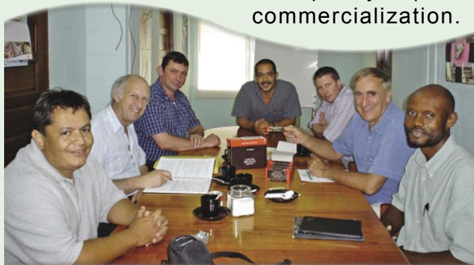
Members of the cacao task force meeting with officials of Green and Blacks to discuss expansion of the organic cacao industry in Belize.

The program will proceed with the preparation of a regional project and identification of funds for the development of a regional strategy for expansion and export of fruits in the region.