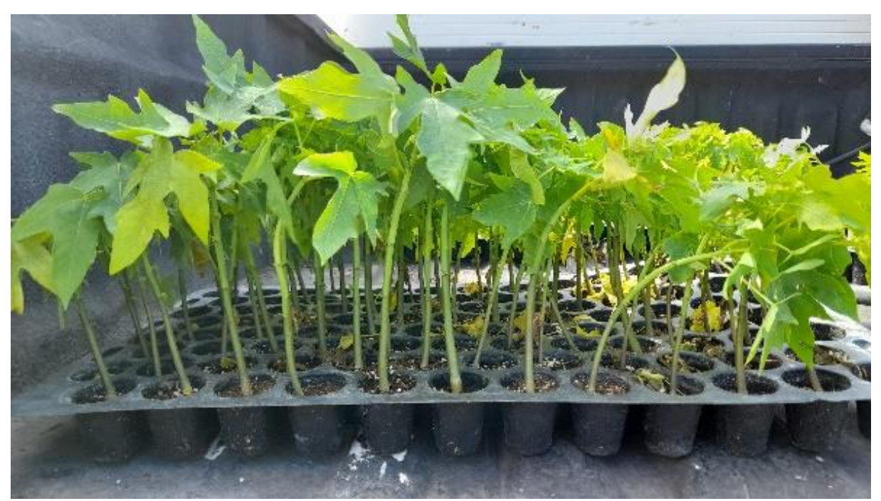
Figure 6: Papaya seedlings ready for transplanting at CARDI Barbados

It is expected that both projects will collectively contribute to resuscitating the papaya industry resulting in a reduced reliance on imports and increasing access to fresh fruit in Barbados.