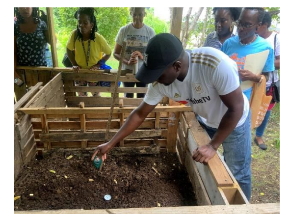
Figure 13: Checking temperature of compost