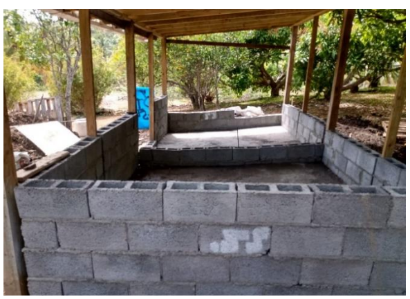
Figure 10: Composting shed post rehabilitation