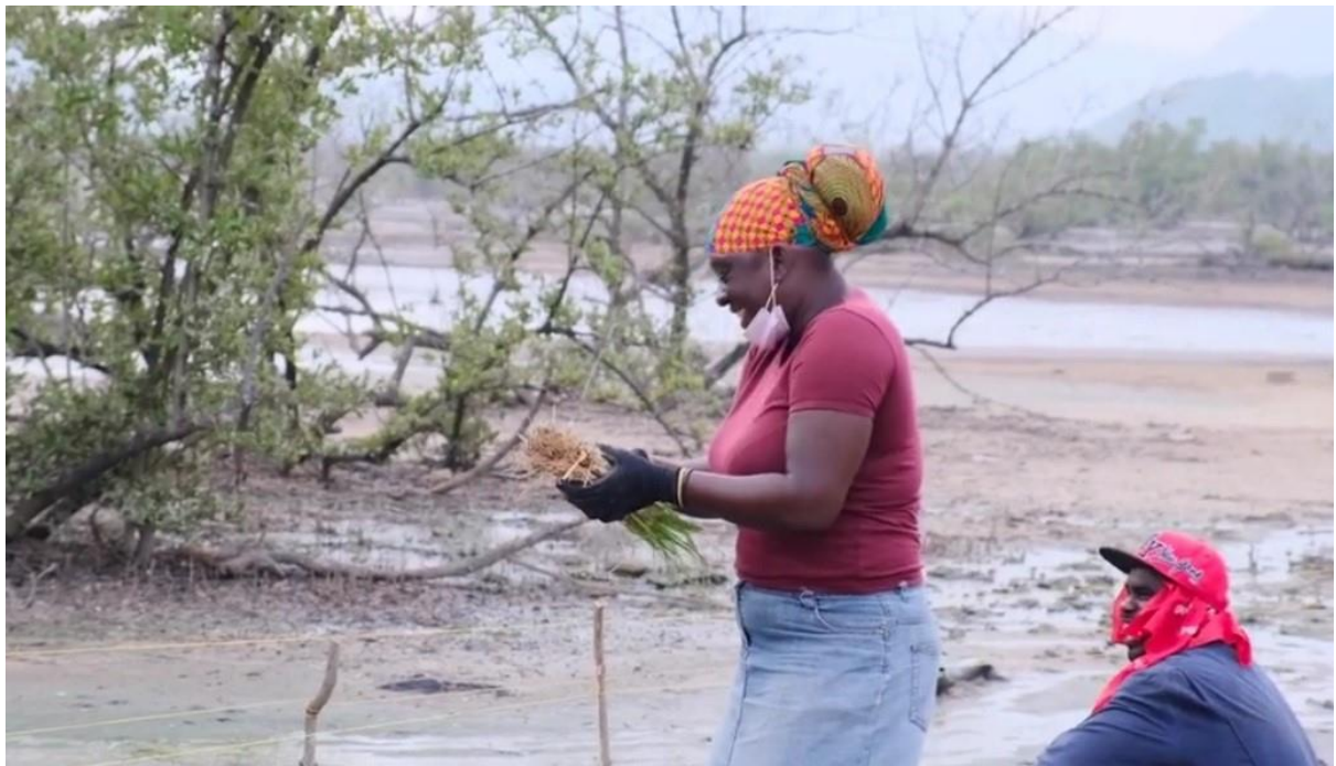
Figure 3: Establishing Vetivier hedgerow at the Cook's landfill

CARDI provided technical guidance to the project partners on the grass' agronomy, fertilizer regime, soil and water management and weed control strategies. From these nurseries planting material were supplied to establish hedgerows along the perimeter of the landfill. The hedge will control soil erosion and leaching of toxic chemicals - both hazards to biodiversity in the area. The project was supported under the CBF EbA Facility, financed by the Government of Germany, German Development Bank (KfW) with resources from the International Climate Initiative (IKI) of the German Ministry of the Environment, Nature Conservation and Nuclear Safety.