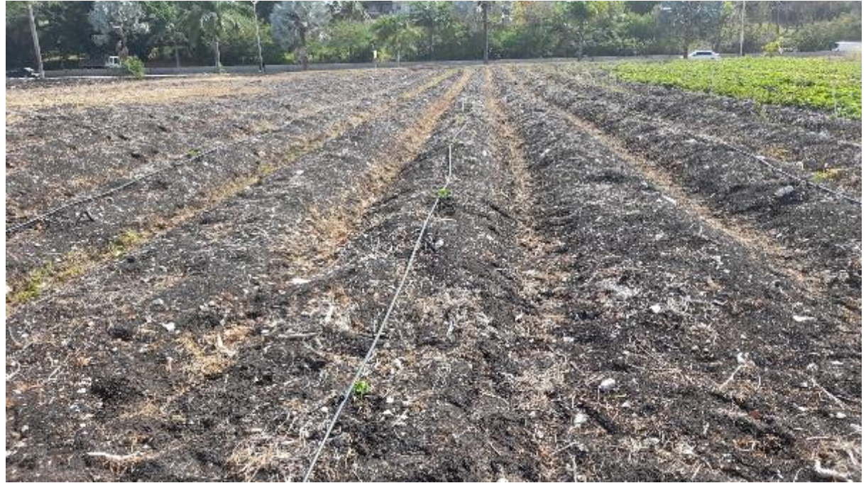
Figure 7: One week old transplanted papaya seedlings at the CARDI field station