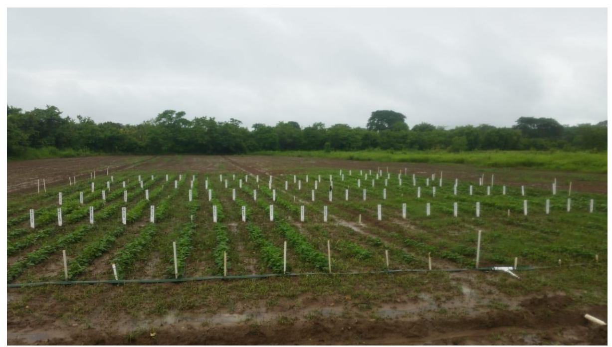
Figure 8: Biofortification bean trials at the CARDI field station in Central Farm

The beans for 63 accessions, harvested from the Observation Yield Trials conducted by CARDI Belize were sent to CIAT for analysis in June 2022. However, the breakdown of equipment at CIAT is delaying the results of this analysis.