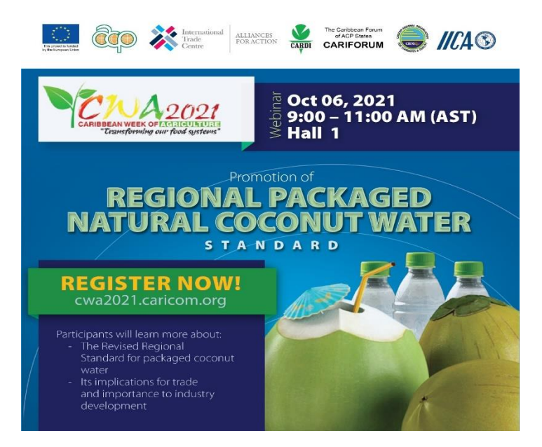
Figure 18: CARDI and IICA in collaboration with other agencies hosted a webinar on regional packaged coconut water at CWA 2021

IICA is an observer on the Board of Directors of CARDI and in this position, has provided valuable insights into improving the governance mechanisms of the organization.