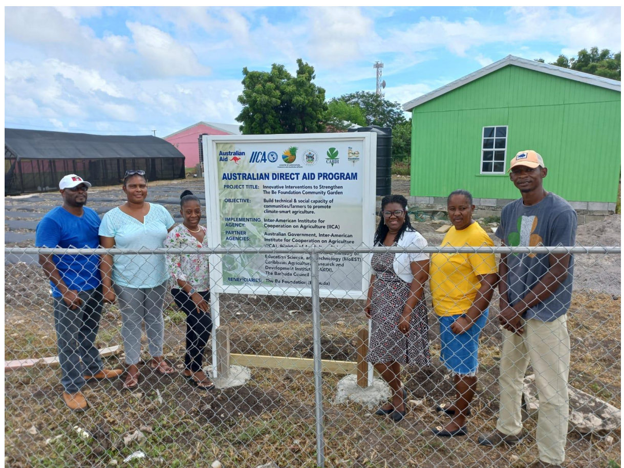
Figure 4: Stakeholders at the site of the refurbished Be Foundation Community Garden

women inclusion. The team will continue to lend their support and offer technical advice to the Foundation on areas such as good agricultural practices and pest and disease management.