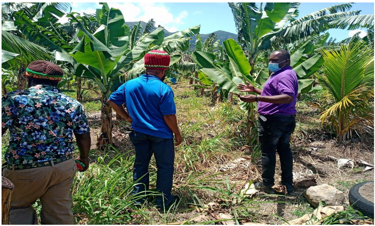
Figure 15: CARDI Specialist advising extension officer and farmer on irrigation and succession planting in bananas

The technical team visited the DOA's Fahies Outreach Center, and a leading banana farmer in St. Kitts to demonstrate the propagation of various tuber crops.