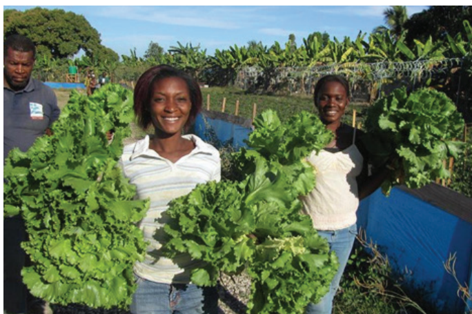
Limited processing capacity for agroforestry by-products