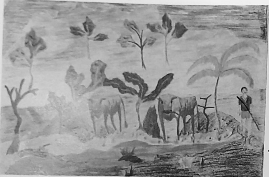
Angelique Ramautar, 14 years old