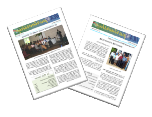
"Partnership" Issue 16 & 17

The office continued its publication of the bulletin "Partnership" to provide information on IICA's activities and highlight important topical issues on agriculture and rural development. Issue 16 was published in March and featured topics on Agrotourism, Global Warming and Youth Leadership in Agriculture. Issue 17 was pub-