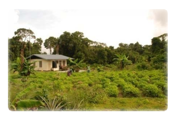
Demonstration plot at the Medische Zending (Medical Mission) at Duwatra

The slogan launched on the community workshop: "COMME-WIJNE IS RICH AND READY FOR AGROTOURISM" indicates the inspiration and aspiration of the community.