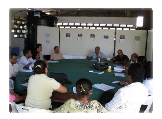
Participants at Agrotourism Workshop

The driving forces of Culinary Tourism, with particular emphasis on rich and diverse heritage, were identified and appropriate Surinamese examples given to legitimize the trends. participants were subsequently exposed to the profiles of culinary tourists and engaged in discussions on the types of tourists with whom they were familiar.