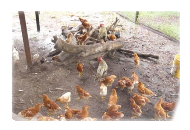
Poultry Project at Brownsweg

the participants. Each participant received 36 to 42 layers.