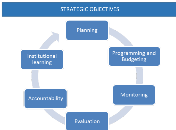
Diagram 2. Process cycle for integrated management of institutional cooperation.

During the 2018-2022 period, IICA will employ a results-based, integrated management of technical cooperation , in response to the demands and needs of Member States at the national, multinational and hemispheric levels. In keeping with this approach, the Institute's management system will be grounded in six interrelated and integrated processes: planning, programming and budgeting, monitoring, evaluation, accountability and institutional learning, as summarized in the following diagram: