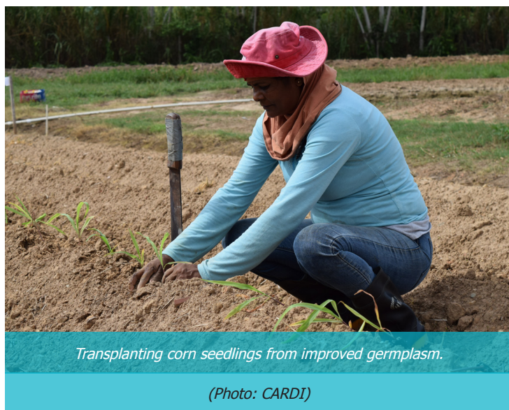
Transplanting corn seedlings from improved germplasm.

There are specific food crops and animals that have been prioritized under the APP for germplasm improvement. These are cassava, sweet potato, yam and dasheen, in the roots and tubers group; corn, beans and peas, in the grains and cereals group; hot pepper, in the herbs and spices group; and goat and sheep, in the small ruminant group. These plants and animals were chosen because they have a long history of production in the Region, satisfy local food preferences, have potential to reduce the food import bill, and provide important sources of income for farmers in the Region. The list of priority commodities for the Region also includes banana and plantain, as well as a range of organic vegetables, including produce grown in protected agriculture systems (enclosed structures and shade houses).