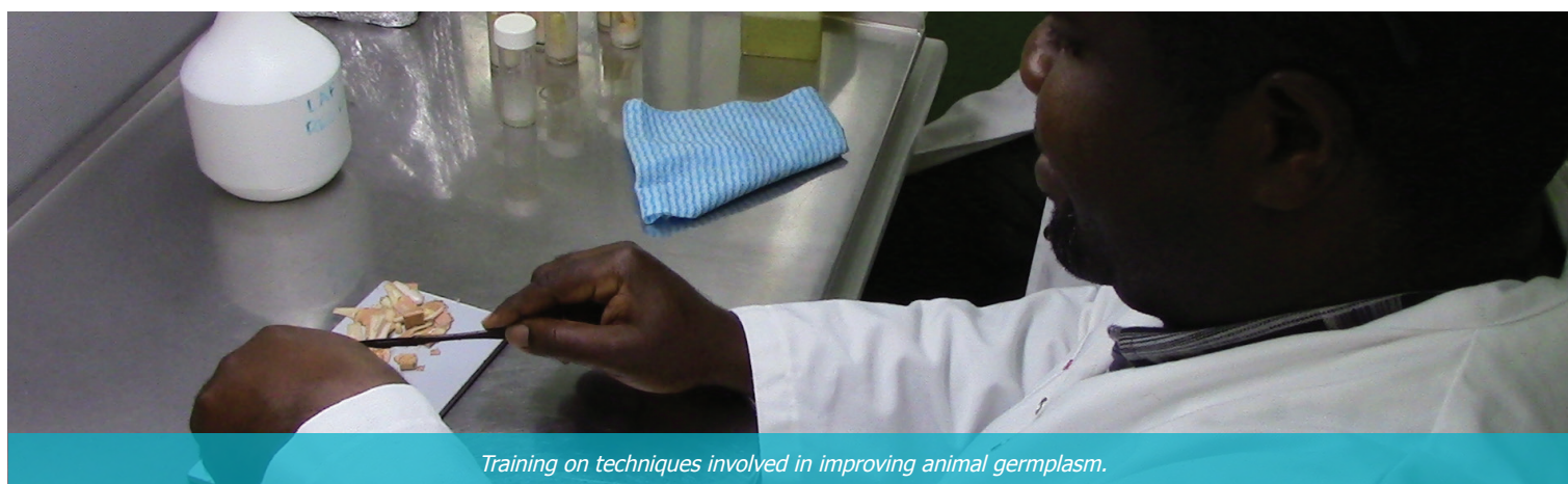
Training on techniques involved in improving animal germplasm.