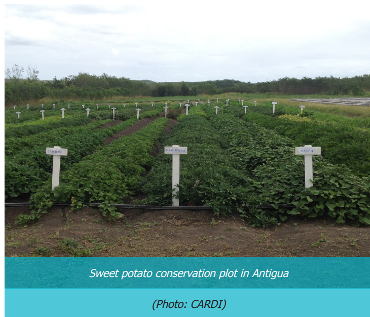
Sweet potato conservation plot in Antigua

Some politicians have equated food and nutrition security as having the same significance as national security, yet food and nutrition security continues to be a major cause for concern in CARIFORUM countries. This is clearly illustrated by the continued lamentations of CARICOM member states’ about their increasing and substantial reliance on food imports. These imports are estimated at more than US$5 billion across the region annually, not to mention the steady increase in and volatility of food prices, and the decrease in investment in agriculture in the Region over the last decade.