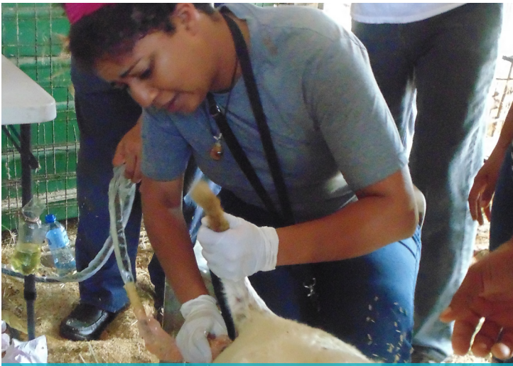
Training on techniques involved in improving animal germplasm