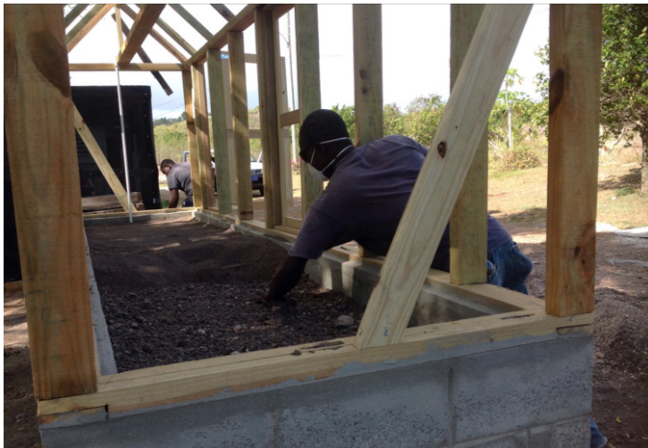
Humidity bin at MOA Cotton Station in Antigua

With proper facilities in place, countries can move forward with confidence in the process of developing, multiplying and managing improved germplasm for both plants and animals. Consequently, the next step is to ensure that protocols are in place to simplify the movement of disease and pest free germplasm and planting material within the Region. To achieve this, receiving countries must be assured that their agriculture will not be compromised or threatened by the incoming material.