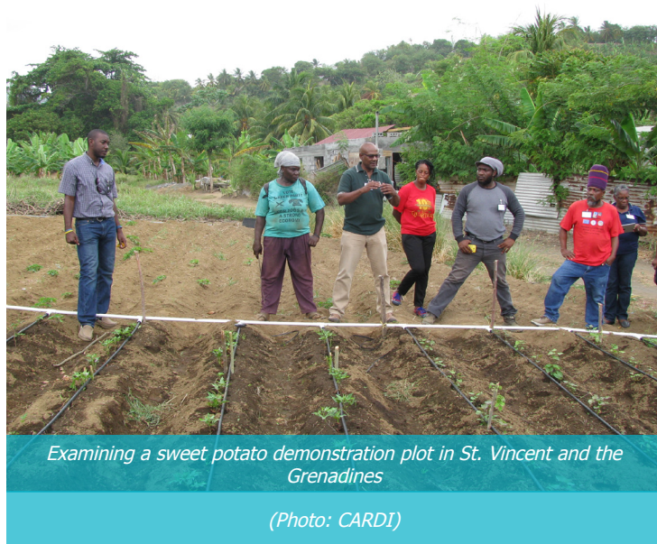
Examining a sweet potato demonstration plot in St. Vincent and the Grenadines

The UWI Faculty of Science and Technology in Mona, Jamaica hosted a Research and Technology Day in early 2016. There, the opportunity was taken by CARDI to demonstrate and transfer knowledge, through research under C2, on the roots and tubers tissue culture propagation process. This included a public lecture on the weaning and hardening of tissue culture material, conducted by a CARDI Biotechnologist. A wide cross section of participants, including technical persons, extension personnel, technical staff of other research institutions and youth, were in attendance. The opportunity was also used to distribute planting material.