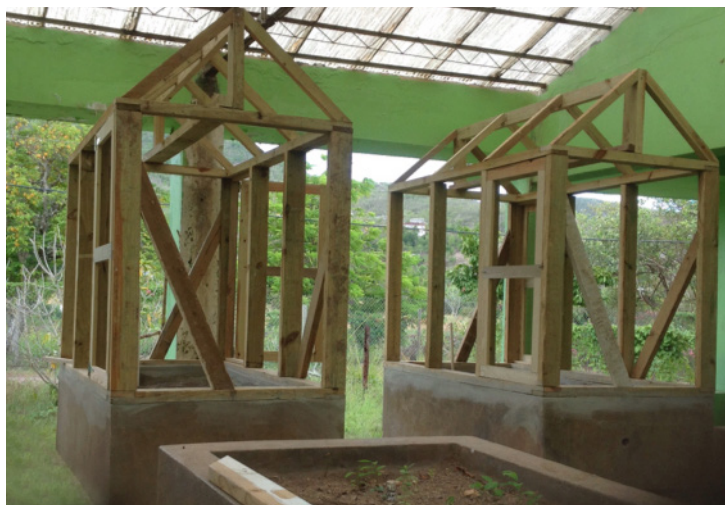
Humidity bins at MOA Green Castle Station in Antigua

Going forward, CARDI is gearing up to begin a genomics programme to breed new germplasm or consolidate existing germplasm. With projects such as this and the recommendations noted, regional small and medium scale farmers would be able to expand their production base and target both national and regional markets, therefore improving the food and nutrition security situation across the Region.