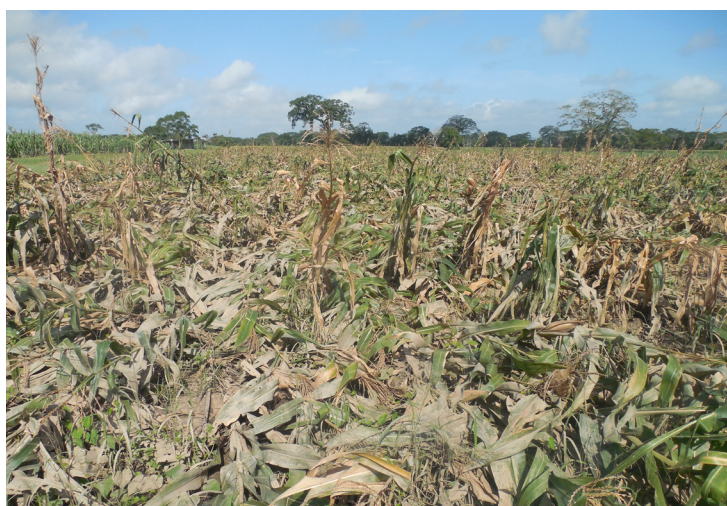
Impact of climate change on corn crop in the Caribbean

Climate change has and will continue to impact water availability in the Caribbean, with longer periods of drought and changes in the timing of the wet and dry seasons. The change in seasonal peaks, as well as increased temperatures, leads to different pests and diseases which attack a commodity. An example of this was the recent massive outbreak of cassava hornworm ( Errinyis ello ) in Trinidad and Tobago after a prolonged drought. These types of incidents often lead to the use of different agri-chemicals to address the challenge. All of these factors put new and intense strain on a variety, which often leads to under-production or even crop failure. Consequently, improved plant germplasm needs to be carefully researched, developed and tested in different agro-ecological zones before being distributed in the Caribbean Region in order for crops to withstand these new challenges.