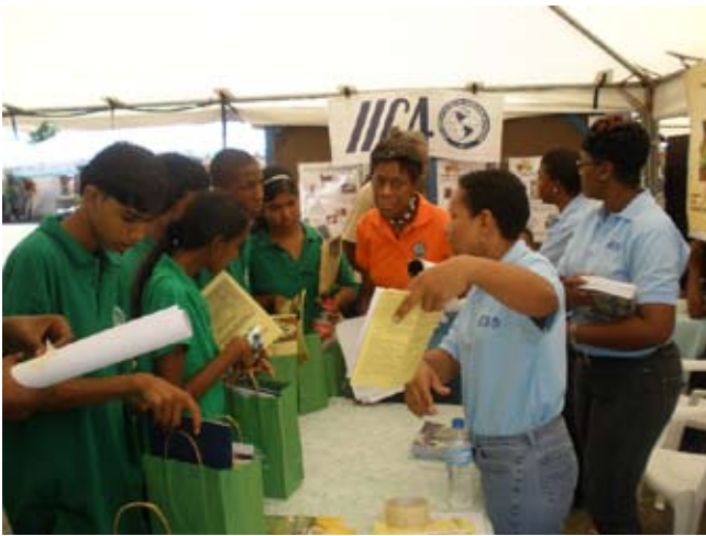
IICA BOOTH AT WORLD FOOD DAY EXHIBITION