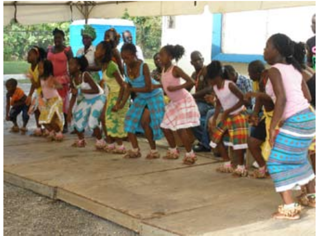
SURINAME DAY CELEBRATIONS