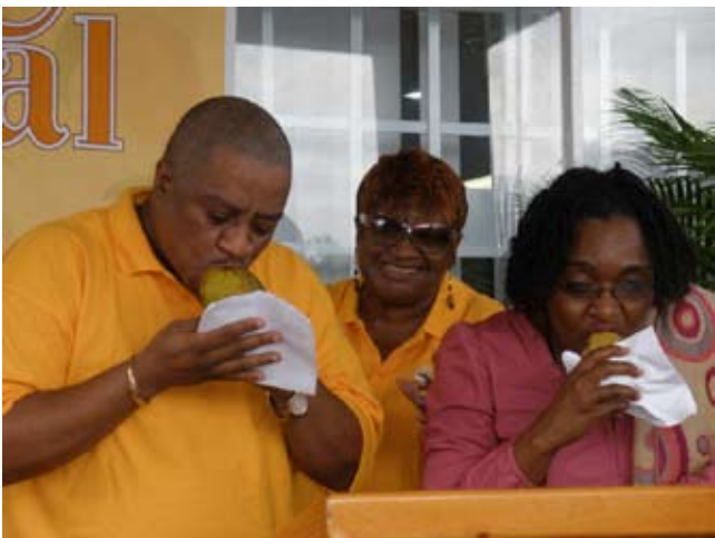
LAUNCHING THE MANGO FESTIVAL WITH THE "MANGO BITE"