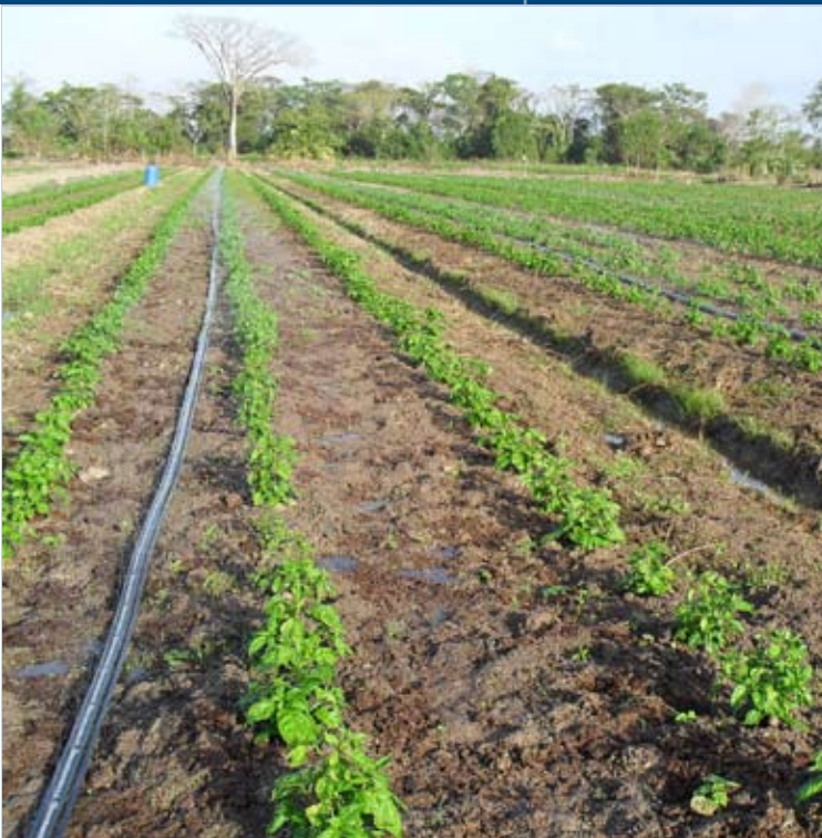
Pepper farm in east Trinidad