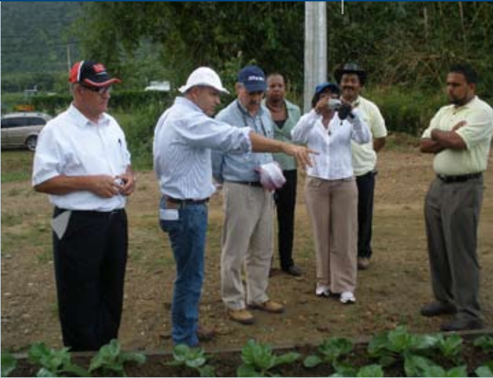
Resource persons from Costa Rica sharing knowledge and expertise on crop management with officials at one of the mega farms.

The IICA offices in Costa Rica and Trinidad & Tobago collaborated on two missions - the first to Costa Rica - under the framework of the Centre for Leadership - which included the visit of a team of officials from the agricultural sector in Trinidad and Tobago. In November, key resource personnel who were met on the Costa Rica tour, were brought to Trinidad and served as resource persons in the sensitization session on extension service delivery.