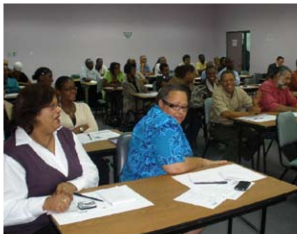
Agrotourism stakeholders at the seminar

The Office held a seminar for stakeholders within the agro-tourism sub-sector. The seminar presented results obtained under the IICA/OAS project “Strengthening of the Tourism Sector through Linkages with the Agriculture Sector in the Caribbean”, which ended in March 2009. The seminar was also an occasion for stakeholders to network, share experiences and discuss some ideas for growth in this area of work.