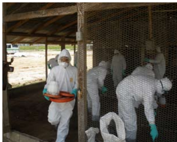
National Avian Influenza simulation exercise carried out during the VEP workshop