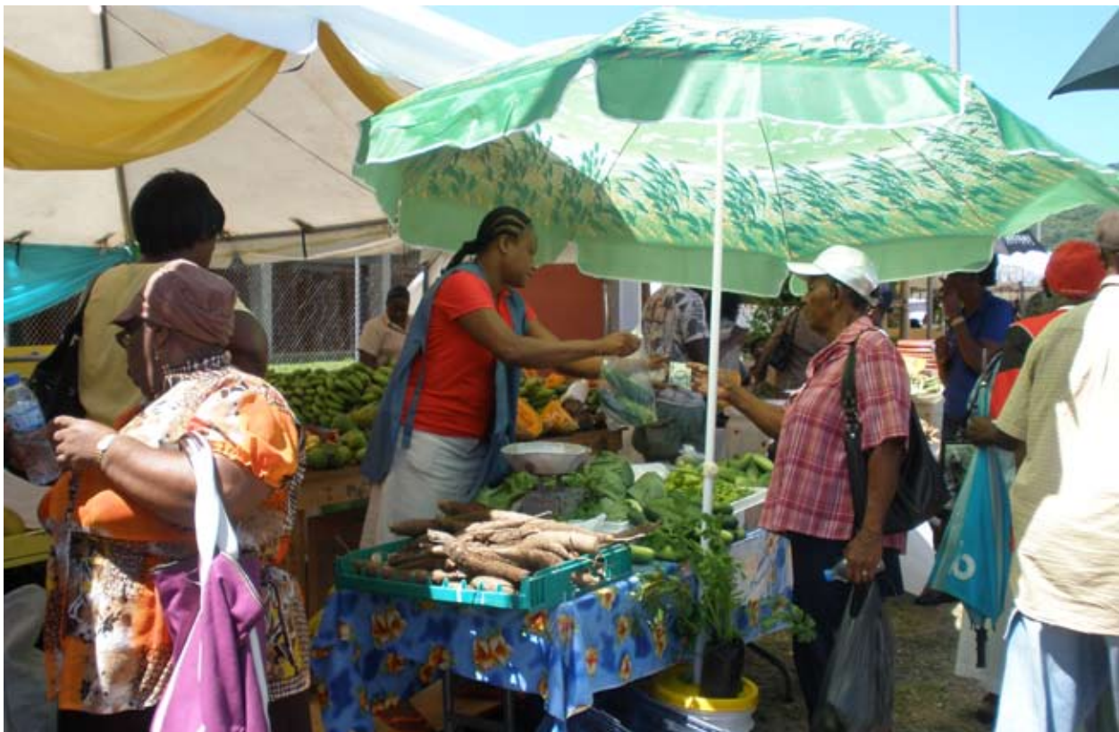
Market scene in Tobago