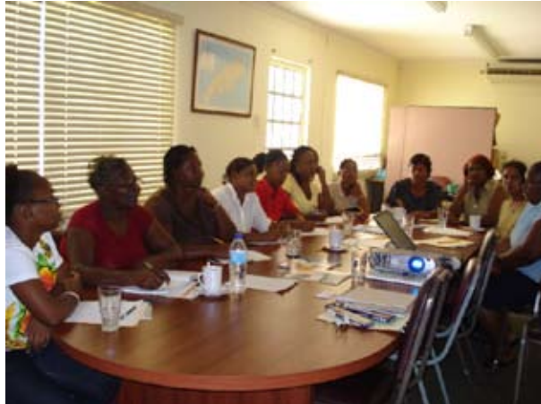
Members of the Network of Rural Women Producers participating in a training exercise on Project Preparation at the IICA Office

As part of its programme to support capacity building activities of the Network of Rural Women Producers (NRWP), IICA delivered a short training course in Project Preparation for members of the network. The main aim of the training was to increase the network's capacity to mobilize resources for the implementation of special projects. Eleven women successfully completed the training.