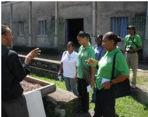
Members of the Brasso Seco Paria TAC, the Ministry of Tourism and IICA participating in a guided tour of the coffee processing facility at Belmont Estate in Grenada

Subsequent briefing sessions with the relevant stakeholders resulted in the design of a way forward including recommendations for follow-up action by IICA, the Ministry of Tourism and the Ministry of Agriculture, Land and Marine Resources.