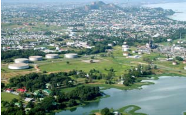
Aerial shot of Petrotrin Oil Company

During 2008, the crude oil market displayed unprecedented volatility. Over the year, crude oil prices averaged US$99.63 per barrel, an increase of 37.9% from the previous year. Oil prices, however, started to decline by August 2008, and plummeted to an average of US $57.12 per barrel by November, a fall of almost US $100 per barrel. A relatively volatile natural gas market prevailed in the US in 2008. Fertilizer prices also shot up sharply for most of 2008. During the first half of the year, high crop and energy prices kept fertilizer prices high: both urea and ammonia which had begun the year at around US$400 per tonne, reached in excess of US $800 per tonne by August of that year.