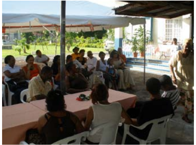
WORLD RURAL WOMEN'S DAY CELEBRATIONS