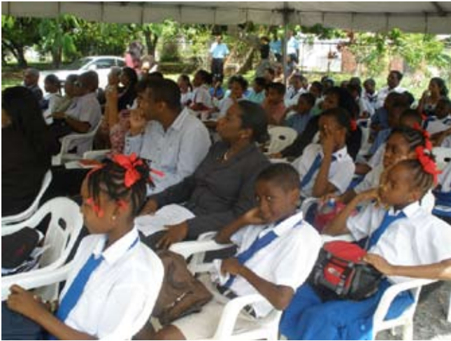
IICA DAY CELEBRATIONS & LAUNCH OF FOOD SECURITY COPYBOOK AND POSTER