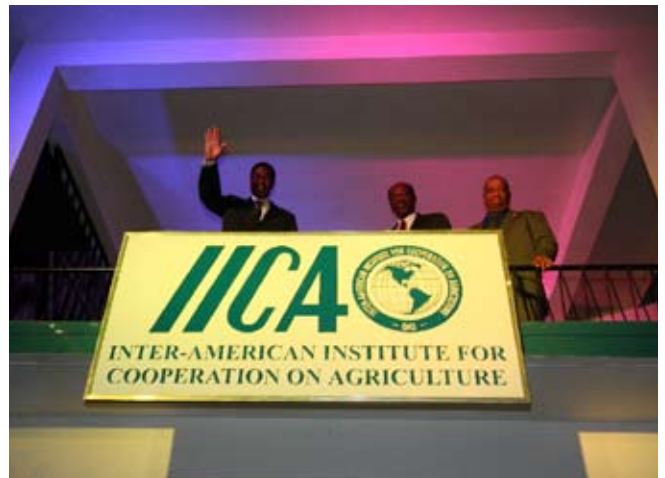
INAUGURATION OF THE OFFICE