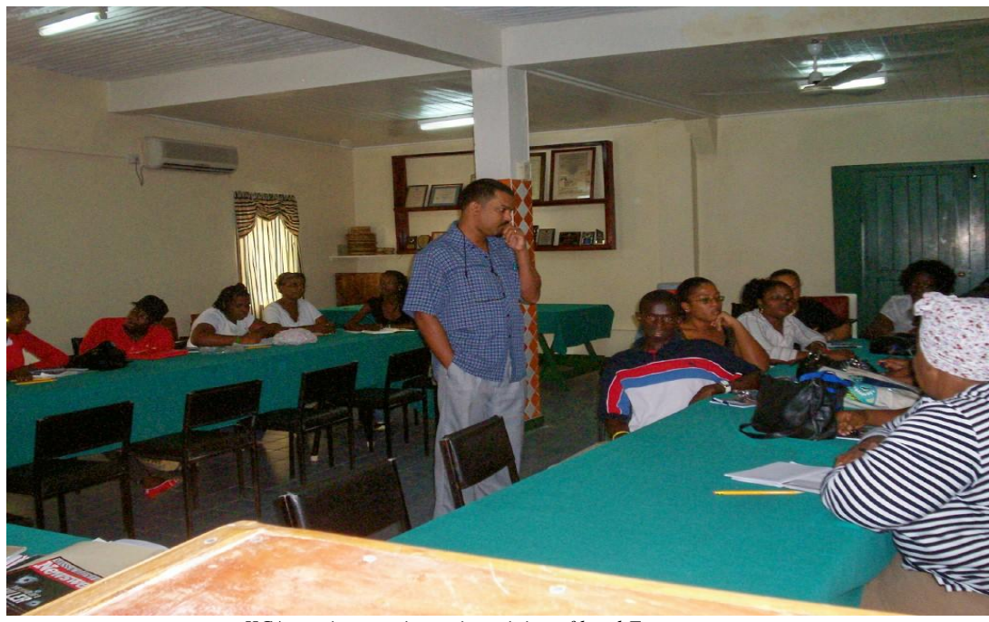
IICA continues to invest in training of local Entrepreneurs

of Grenada. Participants were drawn from the national chapters of the Caribbean Agri-Business Association (CABA), the Caribbean Forum for Youth (CAFY), and the Caribbean Network of Rural Women Producers (CANROP). They listened to presentations on Entrepreneurship , and participated actively in the analysis and discussion of a number of relevant Case Studies. The significance of Business Planning , product differentiation, and market research and promotion was particularly highlighted during the presentations.