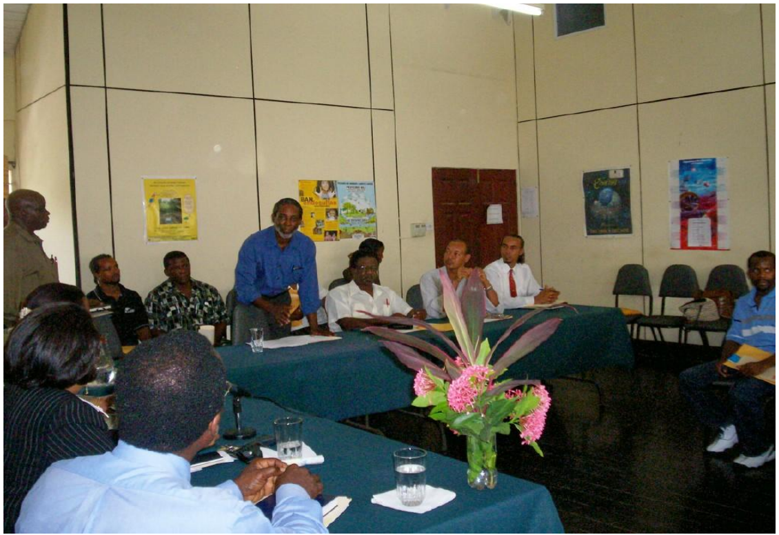
Cross-section of participants at the 2007 IICA Accountability Seminar

Institutions represented at the seminar included the Grenada Board of Tourism; the Biotechnology Laboratory of the MoA; the national chapter of CANROP; UNDP; La Digue Farmers Group; Grenada Bureau of Standards; Marketing and National Importing Board; Produce Chemist Laboratory of the MoA; Pest Management Unit of the MoA; Ministry of Social Development; Fisheries Division of the MoA; Ministry of Education; Agency of Reconstruction and Development; Agronomy Division of the MoA; national chapter of CABA; Extension Division of the MoA; Forestry Division of the MoA; MoA's Ministerial Delegate; CARDI; Planning Unit of the MoA; Grenada Association of Beekeepers; Veterinary Division of the MoA; and Communications Unit of the MoA. The session was presided over by MoA's Permanent Secretary.