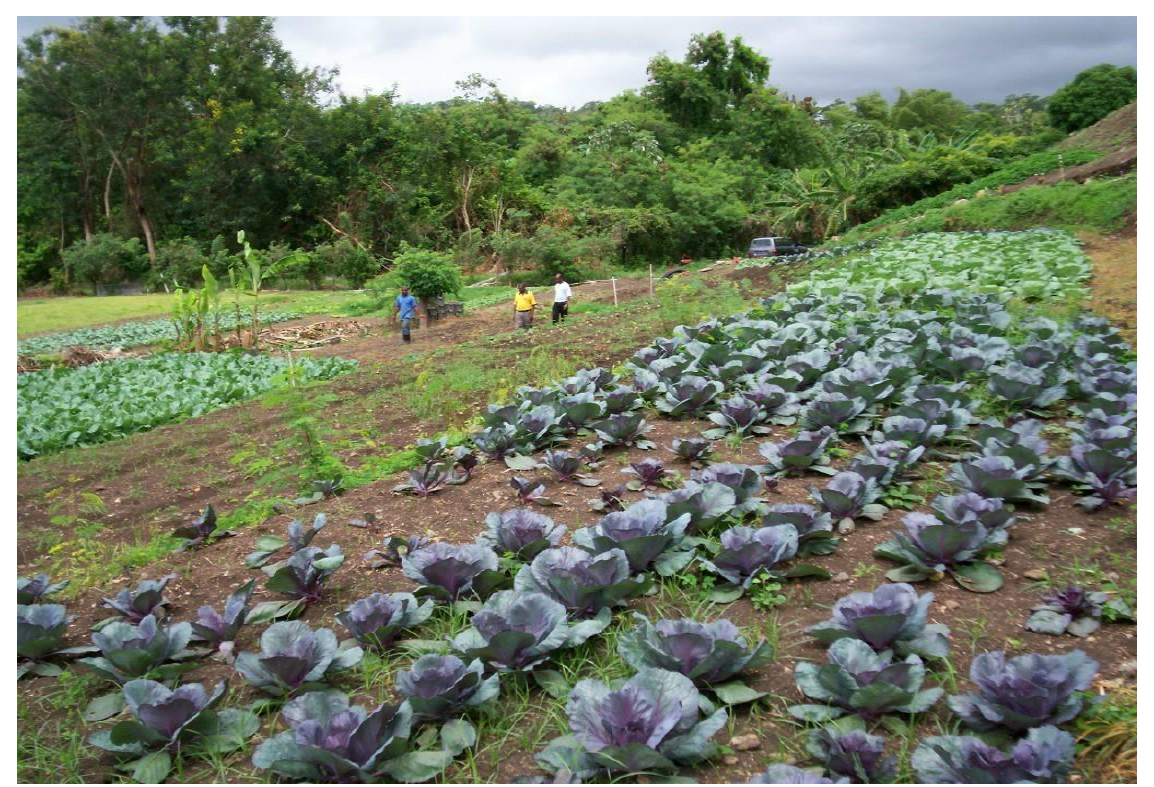
IICA/MoA/GDBS made regular field visits in support of GAPs

periodic advisory farm visits, technicians from these institutions provided the farmers with appropriate record keeping forms as well as documented information on relevant topics, with practical applications. During the year under review, improvements were observed in the farmers' soil conservation measures, field sanitation, use of pesticides, and farm storage facilities. The farmers also gave the undertaking to provide workers with adequate conveniences to facilitate good personal hygiene.