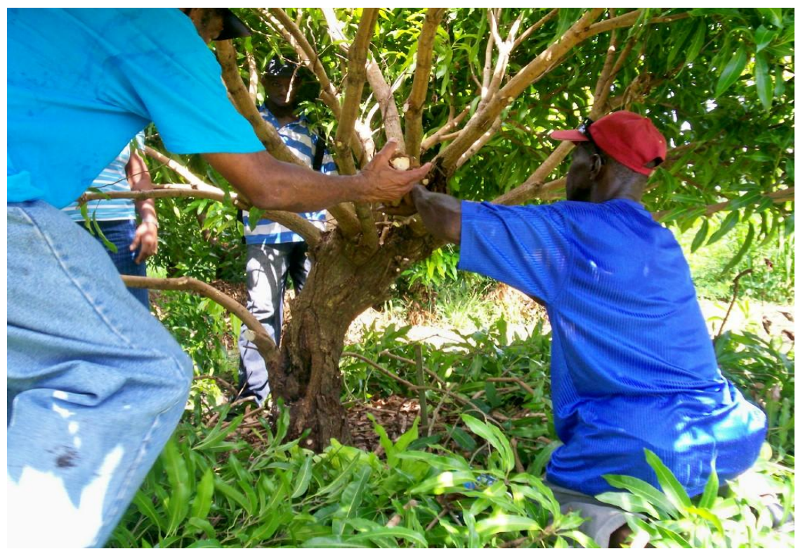
CABA provides training in Tree Crop Management

Twenty-two (22) farmers, including seven (7) women, participated in the course which