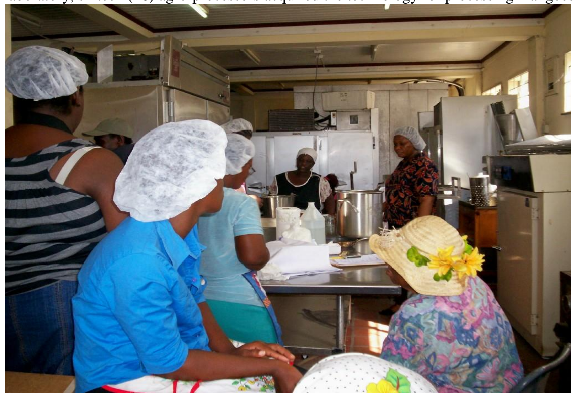
Agro-processors receive training in processing of condiments

4.6.2 The technology for processing two of Grenada's seasonally most abundant but under utilized fruits was effectively transferred. Through their participation in an IICA sponsored workshop, facilitated by the Food Technologist of the Produce Chemist Laboratory, sixteen (16) agro-processors acquired the technology for processing mangoes