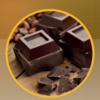
USD 31 / kg Cost of producing a chocolate bar