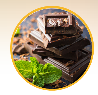
USD 57 / kg Sales price in the national market

These figures correspond to the production of fine or flavor cocoa by means of a standard post-harvest process (fermentation and drying), and the manufacture of a plain chocolate bar (made from cocoa and sugar).