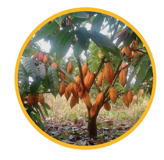
493 kg per hectare Average yield