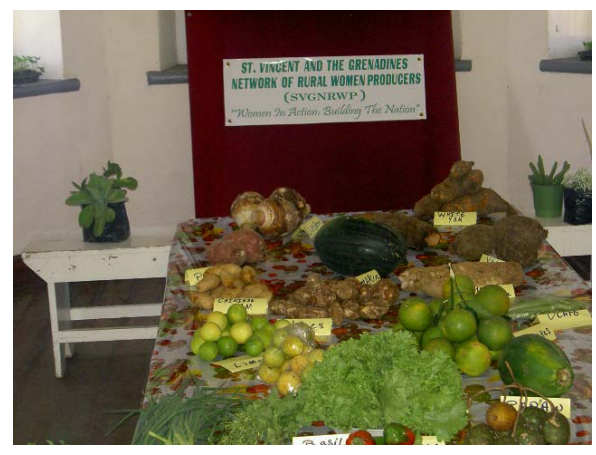
Display of food products by members of the St. Vincent and the Grenadines' Network of Rural Women Producers – World Food Day, Kingstown, October 14, 2005