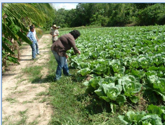
Member of the Foundation of Agricultural Women (SAV)

The members of the Foundation of Agricultural Women (SAV) increased their production and marketing of vegetable products with the coordinating support of the office which facilitated market linkages. Products marketed mainly to hotels and restaurants increased by 25%. Participating farmers and exporters improved the quality of their products prepared for export following monthly post harvest training activities sponsored by the Ministry of LVV, and which received IICA’s support.