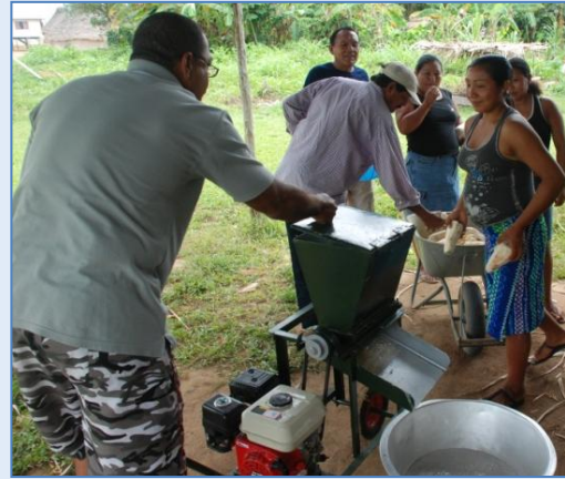
Test Rice plot and demonstration of cassava mill at kwamalasangutu

Tests of improved rice varieties were conducted in the Upper Suriname River communities of Duwatra and Kwamalasamutu in Southern Suriname to assist in the process of providing alternatives to the traditional cassava staple. Under the food security initiatives implemented by the office, improved production techniques were introduced to hinterland communities. These included the use of labour saving devices and the use of nurseries to produce planting materials.