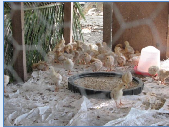
Family Chicken Coop project at Kajapaati

Food Security activities also continued in the Upper Suriname region at Duwatra where an ongoing vegetable production programme continued to be supported at Kayapaati on the IICA/SPC Family Chicken Coop project.