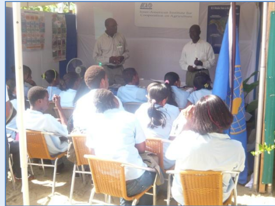
Rainforest Art Festival

The office has participated in and shared information in two major national activities - the Annual Suriname Chamber of Commerce and Fabrics (KKF) Agro/Made in Suriname/ICT Fair and the Rainforest Art Festival with the Theme “Global Warming”. At the KKF fair a booth was set up which highlighted the office’s ongoing activities, including farm rehabilitation and food security activities in Upper Suriname river, Eastern Suriname communities and Kwamalasamutu. At the Rainforest Art Festival the office mounted a display and presented lectures to groups of school children and youth on the effects of Global Warming on agriculture.