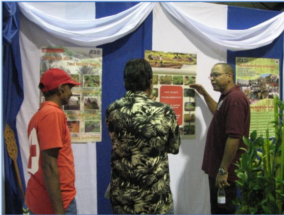
Agro/Made in Suriname/ICT Fair