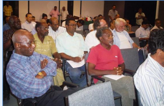
Members of the discussion panel and participants of the National Discussion Forum organized by SAS/KKF/IICA, on Nov 5, 2009

In collaboration with SAS and the Kamer van Koophandel en Fabrieken (KKF), the office co-sponsored a national discussion forum with the theme: “Perspective of the Agricultural Development in Suriname” . There were fifty-six (56) participants at the Forum, drawn from the public and private sectors. Topics addressed included improvement of Suriname’s export of agricultural products to the Caribbean and increasing value added products in the agricultural sector.