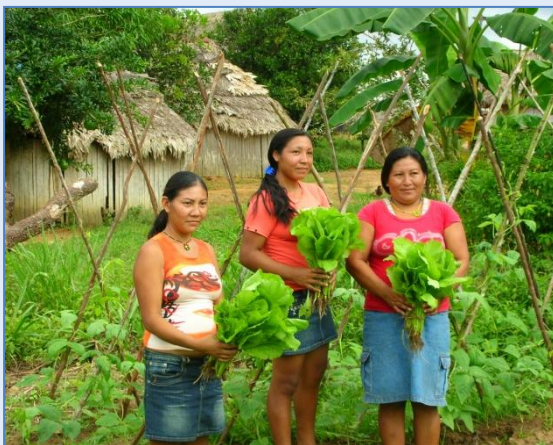
Women farmers at Kwamalasamutu