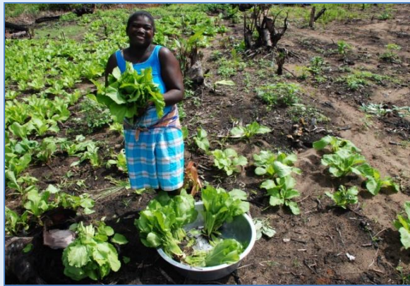
Demonstration plot at Duwatra