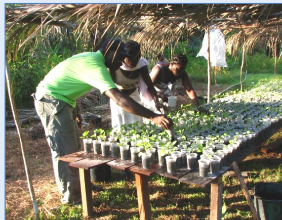
Nursery at Godo-olo

Under an agreement with the Suriname Red Cross (SRC) farm rehabilitation and food and nutrition security activities were implemented in the communities of Godo-olo and Lawa River Basin in Eastern Suriname and Kwamalasamutu in the South. Participating farm households increased their production and consumption of vegetables and improved the food security of their communities. Vegetables produced were also marketed in the communities and to tourist lodges and visitors.