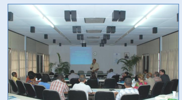
Roundtable Discussion and field visit on Permaculture

In collaboration with the Institute for Development Planning and Management (IDPM) the office co-sponsored a roundtable discussion on Permaculture as an alternative technique for crop production and environmental management for hinterland communities in Suriname. Representatives from public and private sector organizations and hinterland communities participated in the forum which was facilitated by a permaculture practitioner from Trinidad and Tobago.