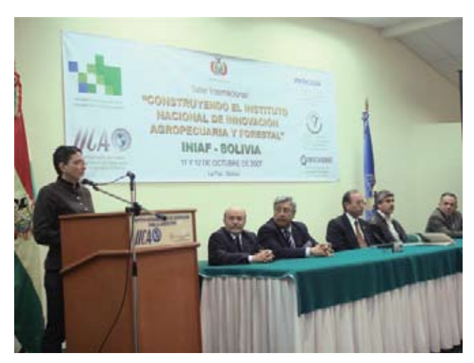
In Bolivia, IICA organized an international activity involving PROCITROPICOS, PROCISUR and PROCIANDINO.

The Ninth Meeting of the Board of Directors of PROCINORTE took place in Washington, D.C., hosted by USDA/FAS. The event provided an opportunity to: (a) discuss PROCINORTE's progress in general and evaluate the results achieved by its four task forces; (b) draw up an action plan and make budget allocations to the task forces for 2008; and, (c) re-evaluate current research priorities. IICA pledged to continue