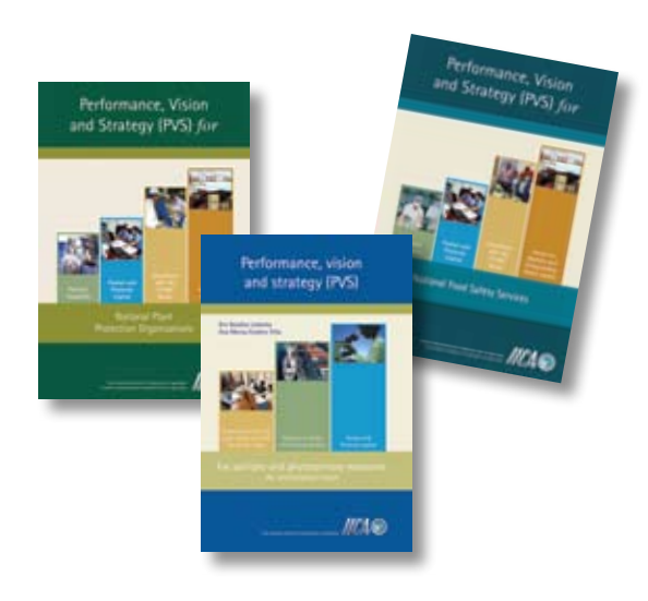
The PVS instruments, which have become an important tool in the cooperation IICA provides, are available in the Publications section at www.iica.int.

In Grenada , the country's agricultural health and food safety legislation was brought up to date and harmonized with relevant CARICOM and FAO regulations.