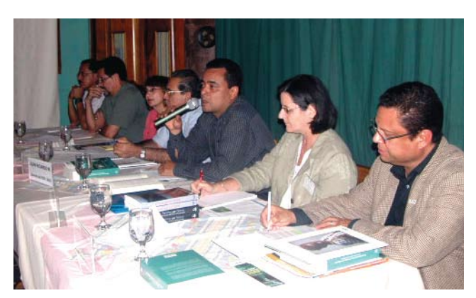
"Leadership for the Development of Ecoagriculture and the Integrated Management of Rural Territories in Central America" was one of the courses designed for rural leaders.

In the Central Region, thirty-three managers, specialists and rural leaders from public and private entities in Central America and Mexico completed the international course "Leadership for the Development of Ecoagriculture and the Integrated Management of Rural Territories in Central America," organized by IICA, the Berkeley University, Ecoagriculture Partners, the IUCN, the National University (UNA), CATIE and the MAG's Rural Development Program (PDR).