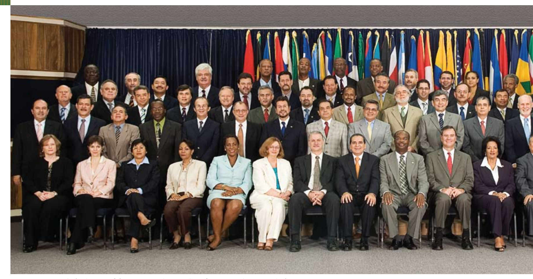
Hemispheric team of the Inter-American Institute for Cooperation on Agriculture (IICA). Representatives' Week 2007.