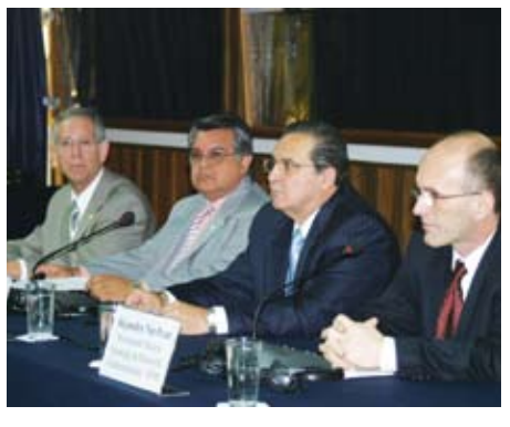
Forum on Transboundary Diseases.