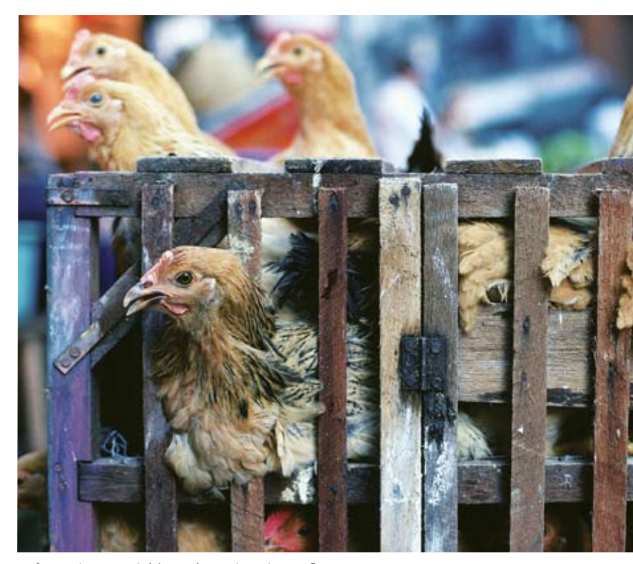
Information on Highly Pathogenic Avian Influenza was disseminated throughout the hemisphere.

Technical staff of the Ministry of Agriculture, Forestry and Fisheries (MAFF) of St. Vincent and the Grenadines and the St. Vincent Banana Growers Association enhanced their capabilities by taking part in a workshop on the identification and management of the Moko and Black Sigatoka diseases. The MAFF implemented the Emergency Action Plan under a program for the rehabilitation of the banana fields.