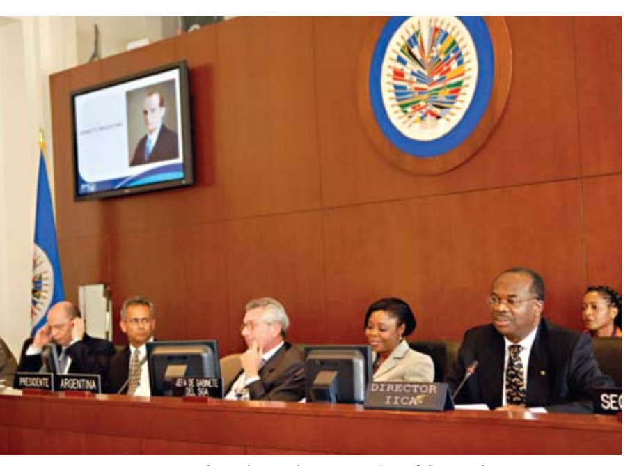
Ambassadors and representatives of the Member States participated in the celebration of IICA's 65th anniversary, held at OAS Headquarters in Washington, D.C.

IICA strengthened existing initiatives and advanced new ones to promote rural prosperity, food security and sustainable development throughout the hemisphere. Numerous agencies in Washington, D.C. were made aware of our technical work through various conferences and forums on the themes of regional integration, hemispheric trade and the importance of agriculture and agricultural and livestock health.