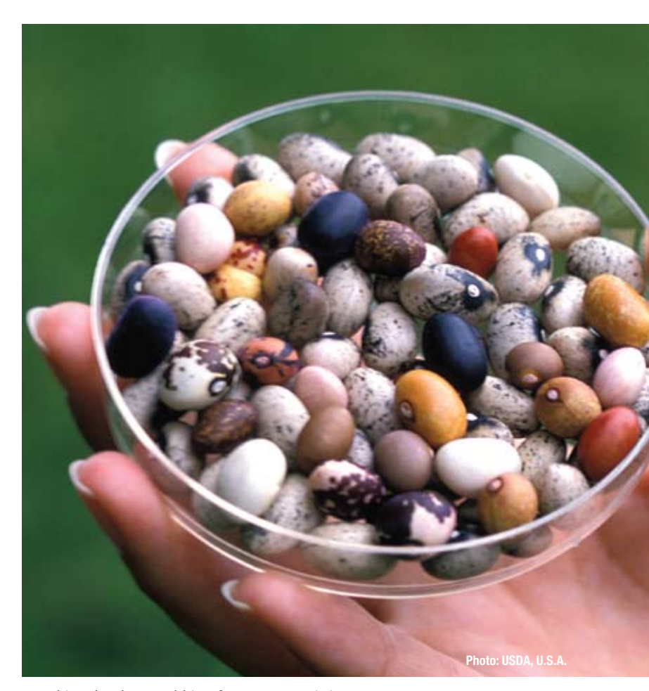
Agrobiotechnology and biosafety are strategic items on IICA's agenda.