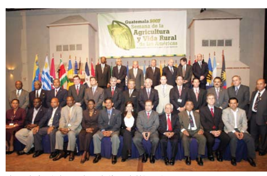
The Week of Agriculture and Rural Life was held in Antigua, Guatemala, in July 2007.

During the Fourth Summit of the Americas (Mar del Plata, Argentina, 2005), the Heads of State and Government reaffirmed the strategic importance of agriculture and rural life for the integral development of the countries. They also endorsed the dialogue and consensus-building in which the ministers of agriculture have been engaged, and their commitment to implementing the Summit mandates. Specifically, in the Plan of Action adopted at the Fourth Summit, the leaders decided to make a national commitment "to support the implementation of the Ministerial Agreement of Guayaquil in 2005, Agriculture and Rural Life in the Americas (AGRO 2003-2015 Plan of Action)."