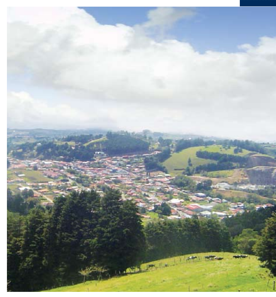
With support from IICA, instruments for planning and measuring the level of sustainable rural development in the territories are being applied.

A community of experts was created in the Andean Region, comprising national technicians involved in sustainable rural development. It will serve as a platform for launching work programs organized with national and international strategic partners, dealing with the development of capabilities for territorial management and for generating and disseminating specialized information.