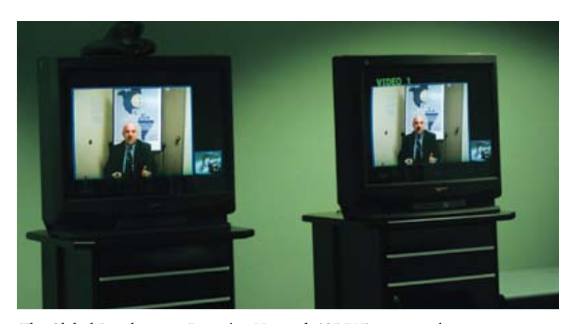
The Global Development Learning Network (GDLN), promoted by the Word Bank, has served as a platform for trade-related training activities.

Other activities included our participation in: the Eleventh Korean-Latin America Business Forum (Korea); a seminar on public policies