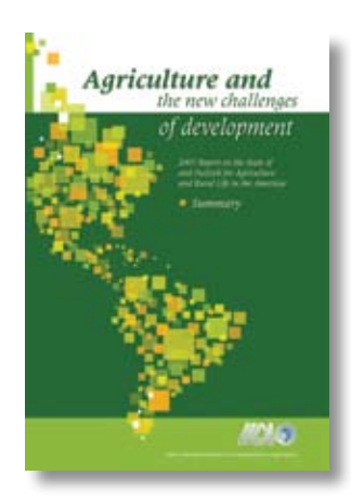
The electronic version of the report is available at: http://www.iica.int, in the section Publications and Documents.

and environmental variables of each of the 34 countries of the hemisphere. Spurred on the need for a common vision of the state of agriculture and rural life, FAO, ECLAC and CATIE, in a joint effort, provided working documents and basic information for the analysis. Similar reports were published for the Caribbean Region and for Dominica and Trinidad and Tobago.