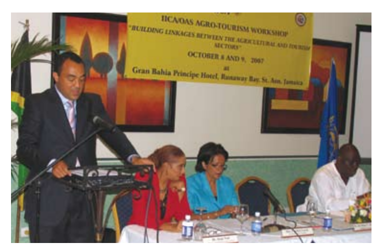
The Minister of Agriculture of Jamaica, Christopher Tufton, took part in the Seventh Caribbean Week of Agriculture, the theme of which was agrotourism.

In Jamaica , in collaboration with the Ministry of Agriculture and Lands, the Institute organized the 7<sup>th</sup> Caribbean Week of Agriculture, the theme of which was "Agriculture - Harvesting Wealth through Tourism." Over 200 participants from several countries took part in workshops on agrotourism, risk management, nutrition and youth involvement in agriculture, and a very successful trade show.