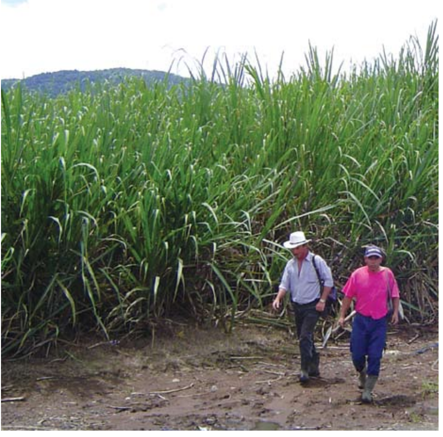
IICA promotes the development of national policies in the area of agroenergy and biofuels.

IICA technical staff made presentations at various forums and seminars in order to disseminate information on the potential, challenges and implications of agroenergy and biofuel production for agriculture, food security, and the rural environment. These included the Thirty-first Conference of the Caribbean Basin; the Second International Biofuel Conference (ENERBIO 2007); a seminar to find solutions to energy problems in isolated rural communities in Brazil; a high-level workshop on the expansion of bioenergy opportunities in the Caribbean, in Guyana; and a seminar in Costa Rica entitled "Agriculture for food or for biofuels? A question to be answered."