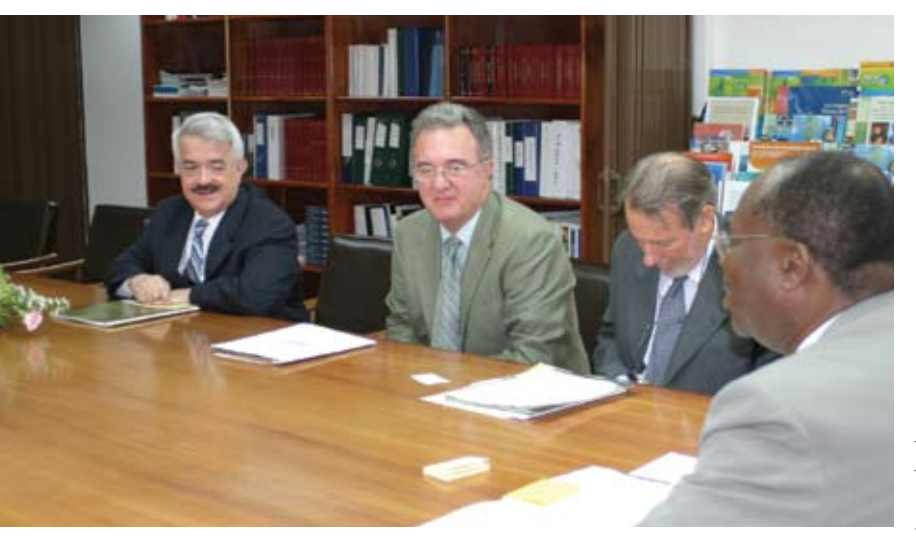
A delegation from the Regional Agricultural Technology Fund (FONTAGRO) visited IICA Headquarters in February 2007.

The IICA/IDB Agreement was extended to 2009, thanks to which FONTAGRO was strengthened as a regional research fund. The studies of the socioeconomic, environmental and institutional impact of the findings of three research projects under FONTAGRO were distributed, as was a methodological proposal on the multidimensional assessment of regional research projects. Support was provided for a workshop on the technical monitoring of regional projects being implemented in Ecuador, and the findings of 12 projects of the Fund's second and third call for projects were disseminated.